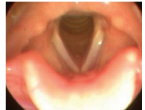
Normal larynx during breathing

There is no preparation required for the procedure. You may eat or drink as you wish. Please arrive 15 minutes prior to your appointment to complete the necessary paperwork.