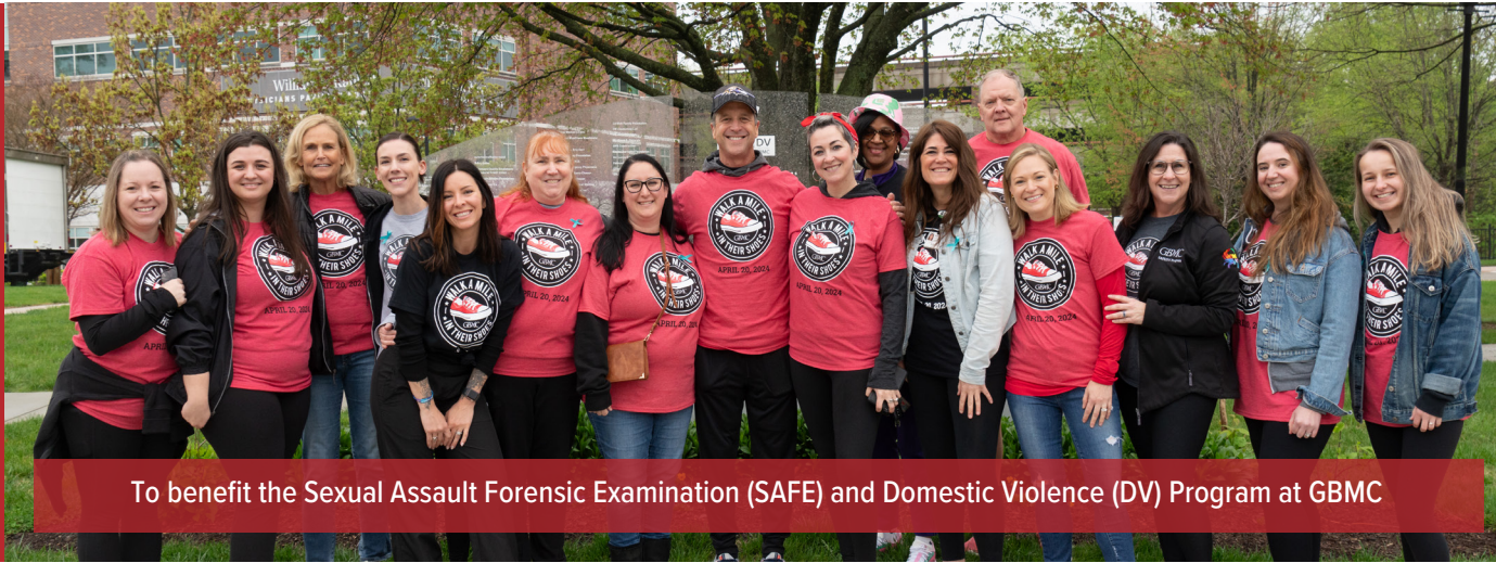
To benefit the Sexual Assault Forensic Examination (SAFE) and Domestic Violence (DV) Program at GBMC

SPONSORSHIP LEVEL: Check one participation level.