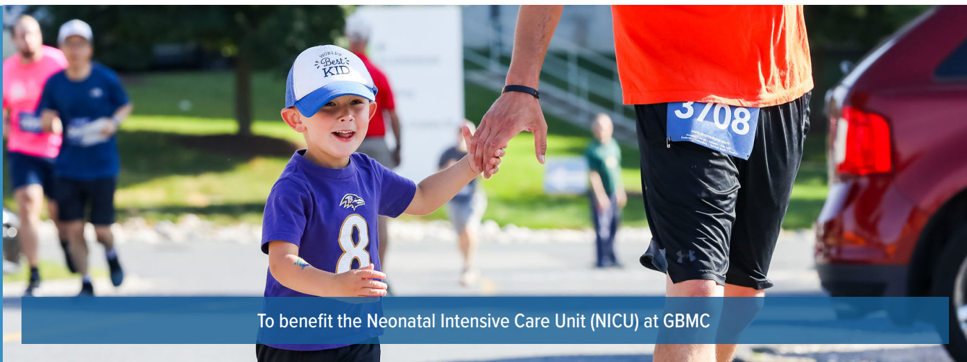
To benefit the Neonatal Intensive Care Unit (NICU) at GBMC